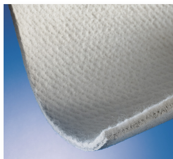
GCL's Geosynthetic Clay Liner