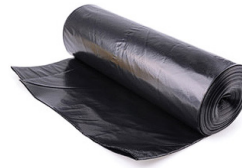
HEFTY REFUSE BAGS