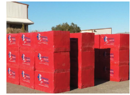
SHROUDS & SHRINK SHROUDS