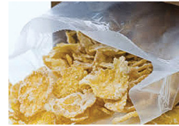
HD / SURLYN SHEETING