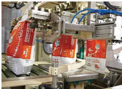
FORM FILL AND SEAL